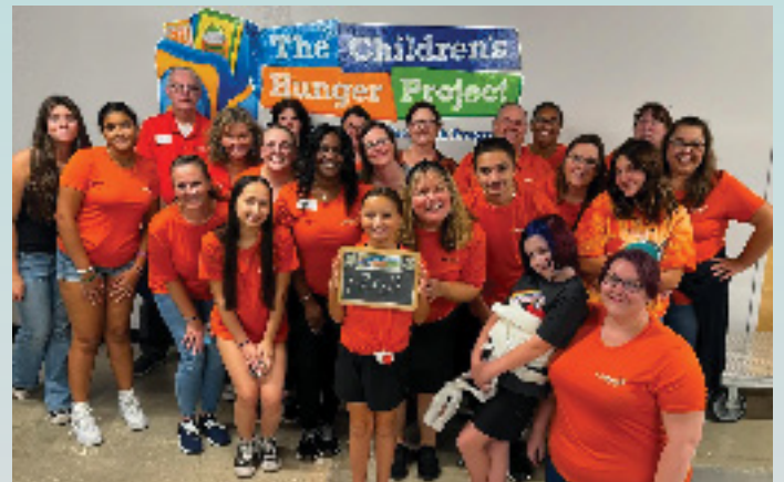
More than 20 Launch employees turned out to pack meals for the Children's Hunger Project in September. Launch employees assist this organization several times a year, with the goal of eradicating child hunger.