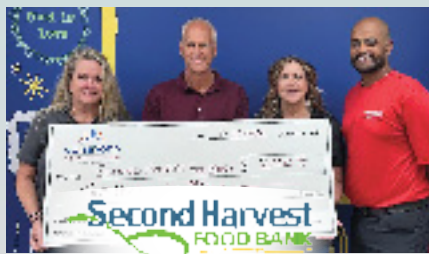
The Launch CU Go Beyond Foundation donates to Second Harvest Food Bank regularly throughout the year. In November, the Foundation donated $4,000 to this worthy organization that works to relieve hunger in our Brevard and Volusia communities.