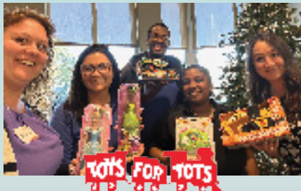
All Launch CU branches collected for Toys 4 Tots! Here are the Melbourne-Wickham branch staff, displaying some of the toy donations from members and employees.

Launch Credit Union employees donate time and money to their communities throughout the entire year. These dedicated and selfless people are proud to help make our areas better places to live. These events are a very few of the worthy causes supported by Launch CU and our employees.